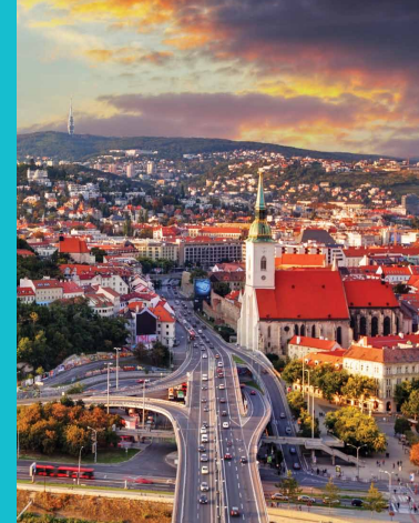
SLOVAKIA • BRATISLAVA