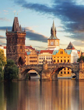
CZECH REPUBLIC • PRAHA