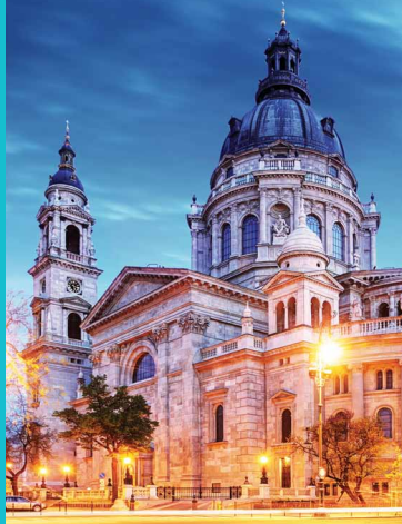
HUNGARY • BUDAPEST