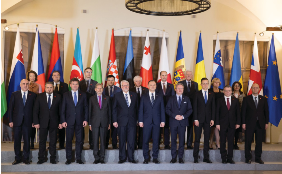
Meeting of the foreign ministers of the V4 and Eastern Partnership states with the President of the Republic of Poland (Warsaw, 12.04.2017)

The talks mainly revolved around the issues of connectivity, which is one of the key priorities of the EaP. At the end of the meeting, the foreign ministers of the V4 accepted a joint statement on the future of the Eastern Partnership, in which they appealed for an intensification of sectoral cooperation, mainly within the scope of the above-mentioned connectivity.