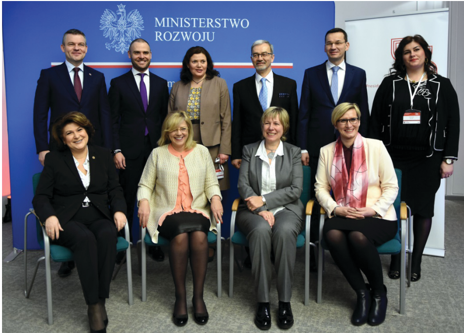
Meeting of the ministers responsible for cohesion policy in the V4 and Bulgaria, Croatia, Romania and Slovenia (Warsaw, 1-2.03.2017)

The Polish Ministry of Economic Development organised an expert meeting (11.01.2017, Zakopane) of the V4 states attended by institutions involved in the implementation of Interreg cross-border cooperation programmes and representatives of the European Commission (EC). The discussion focused on the future of Interreg after 2020 – the aims and scope of cross-border cooperation programmes. The representatives of the V4 states and the EC discussed the possibilities of strengthening and perhaps extending the scope of cross-border cooperation in Europe, increasing visibility of its results and better coordination with other programmes, including regional and national ones. A separate session was devoted to the allocation mechanism for Interreg programmes, and the possibility of creating a separate arrangement for territorial cooperation, and thus a separate set of indicators.