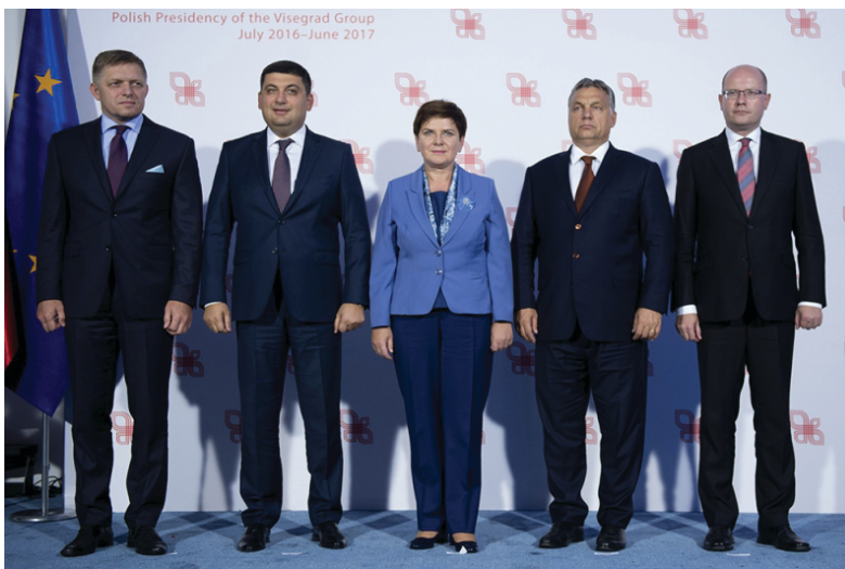
Meeting of heads of government of the V4 states and Ukraine (Krynica, 6.09.2016)

The Economic Forum in Krynica (6.09.2016) was also an occasion for a meeting of the heads of government of the V4 states and Ukraine . The main topics discussed included cooperation and joint initiatives of V4 + Ukraine, cooperation to strengthen infrastructure in the Carpathian region, and the security situation. The prime ministers of the V4 states and Ukraine stressed the importance of long-term cooperation, which supports the development of partner countries and stabilization in the region of Central and Eastern Europe. After the meeting the V4 Prime Ministers issued a joint statement.